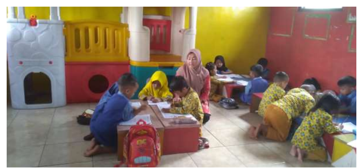
Figure 1. The observation towards the early childhood's independent character in completing the tasks in the classroom

After presenting the data of the observation results, then the researchers describe the data from the interview. The question in the interview consists only one: "What kind of parenting style do you apply to your child at home?" Then, the data are presented as follow.