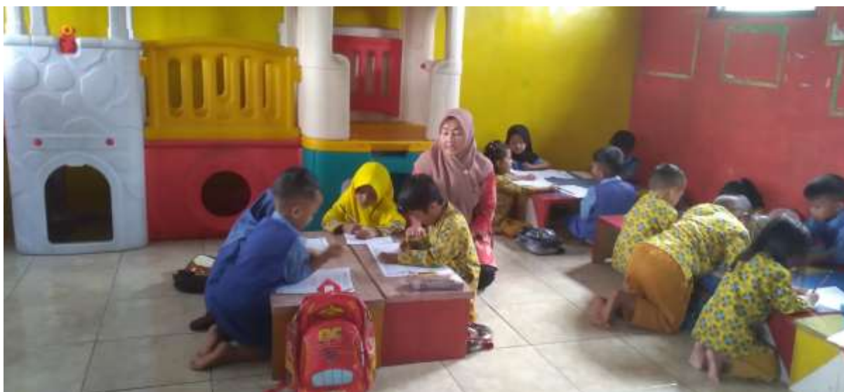
Figure 1. The observation towards the early childhood's independent character in completing the tasks in the classroom

After presenting the data of the observation results, then the researchers describe the data from the interview. The question in the interview consists only one: "What kind of parenting style do you apply to your child at home?" Then, the data are presented as follow.